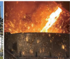
Metallurgy & Mining